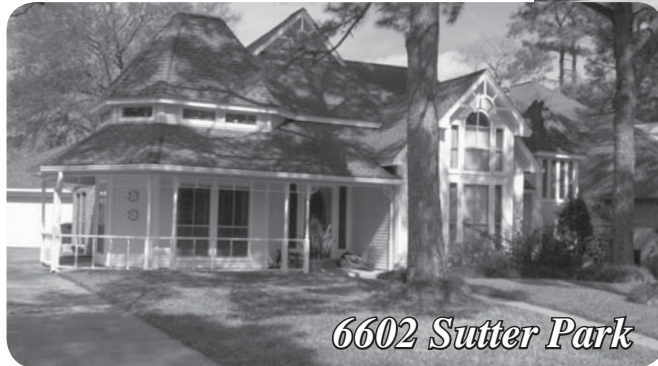
6602 Sutter Park