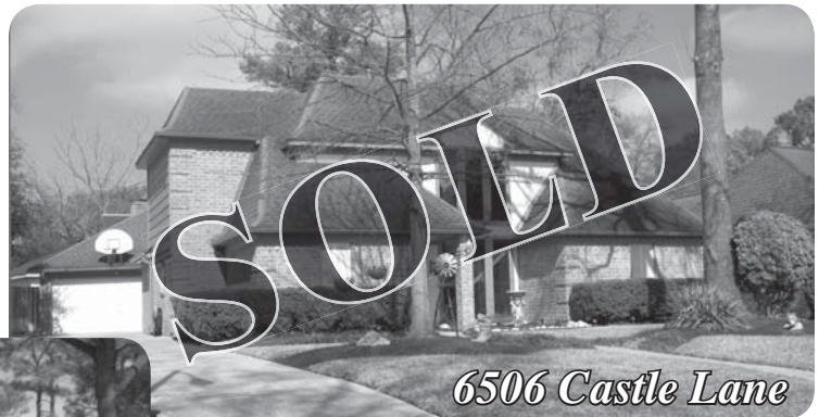
6506 Castle Lane